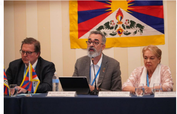
Images from the 2022 Washington D.C. WPCT.

occupation by the People's Republic of China (PRC).